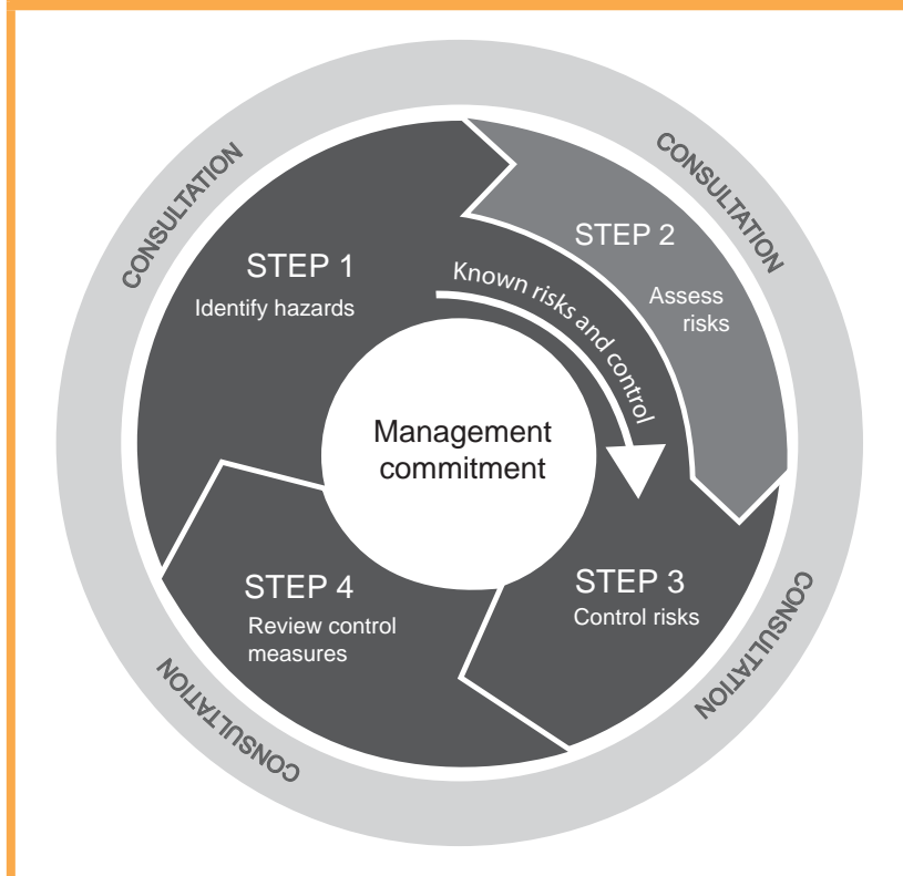
FIGURE 1: The risk management process.

Many hazards and their associated risks are well known and have well established and accepted control measures. In these situations, the second step to formally assess the risk is unnecessary. If, after identifying a hazard, you already know the risk and how to control it effectively, you may simply implement the controls.